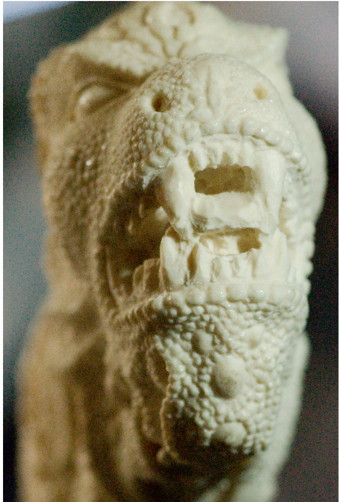
The mouth as a big ball and with roughed out teeth.